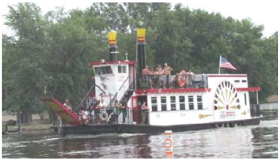
FRIDAY : Lunch on the River