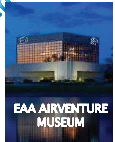
EAA AIRVENTURE MUSEUM